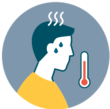
Fever or chills

Symptoms can appear 2 to 14 days after exposure to the virus. The most common symptoms reported are: